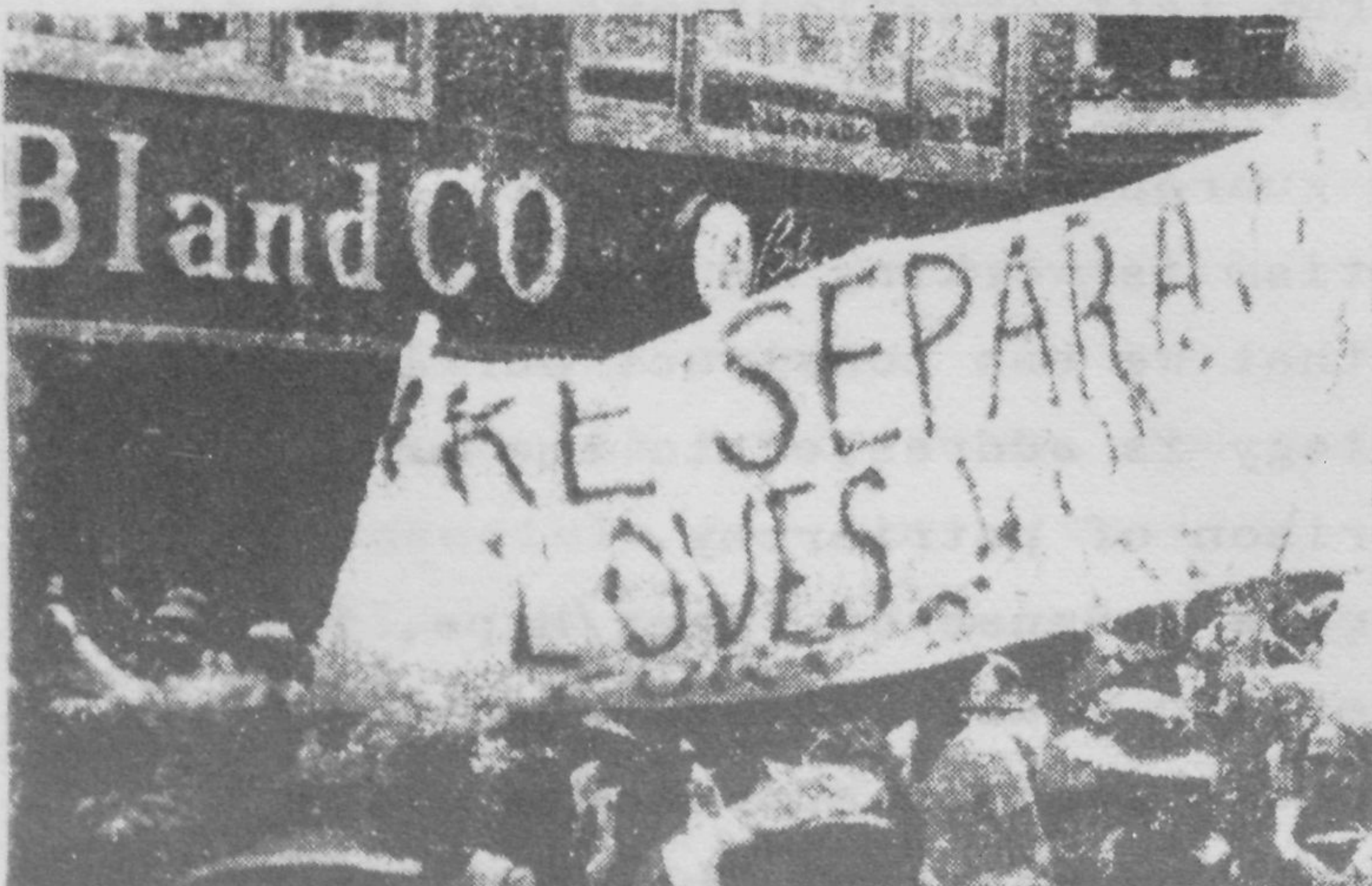
JUNE 26, 1977: FORT DYKE BANNER (DYKE SEPARATISM LOVES WOMEN) MARCHES PAST (AND LEAVES BEHIND) PATRIARCHY'S OWN "BLAND COMPANY"

The lesbian separatists at Fort Dyke understand that political dialogue with other women is a vital part of political work. I believe that a clear understanding of Lesbian Separatism leads to a realization that it is the only ideology that will free all women from patriarchy, through our united efforts. It is important that all women act upon the desire for change in their lives and study Lesbian Separatism as the means of attaining ultimate freedom for all of us.