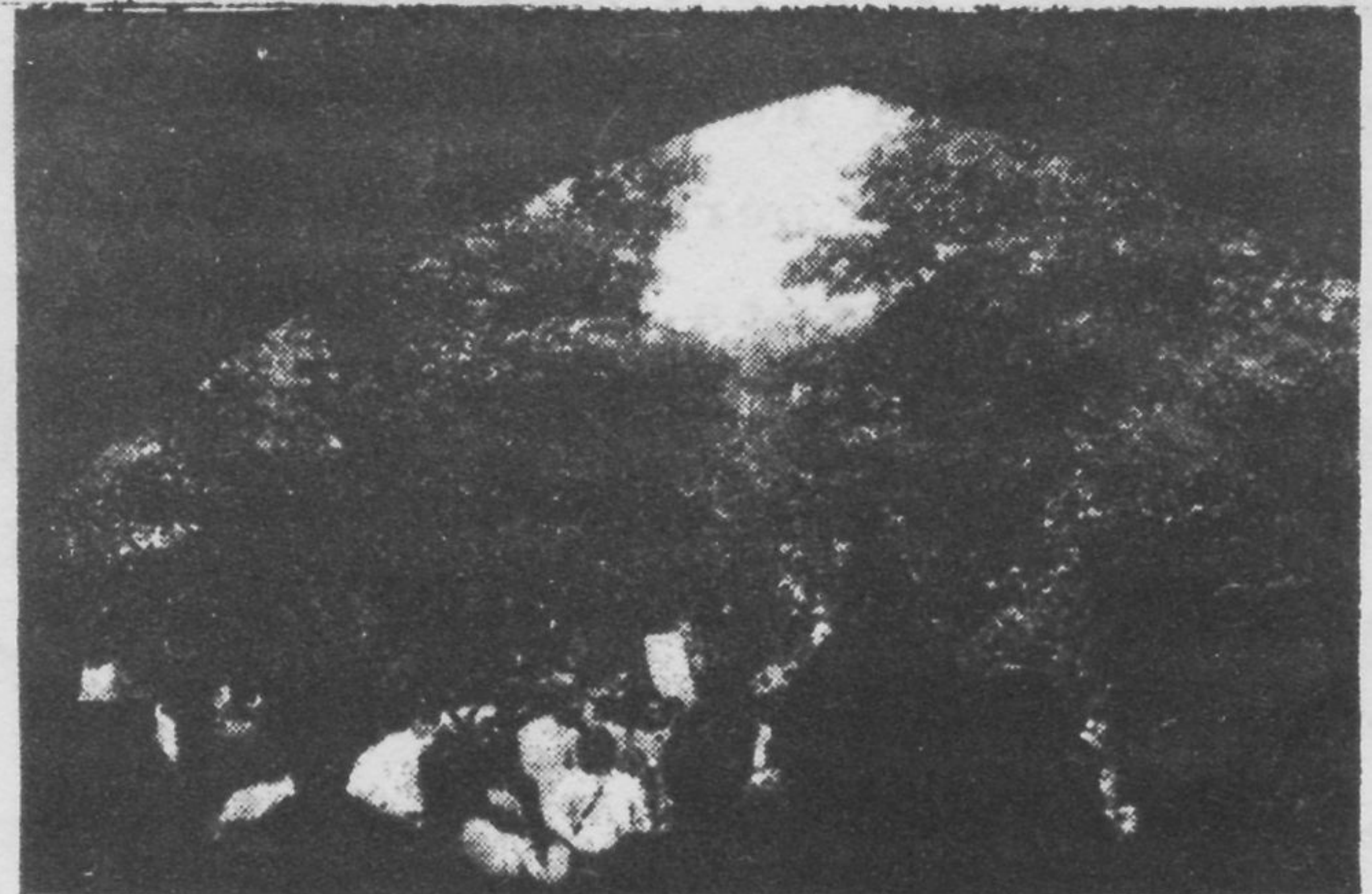
JUNE 26, 1977: DYKES MARCH TOWARD LESBIAN NATION (LESBIAN PRIDE RALLY)

There is no across the board formula for dealing with straight women and straight lesbians. Except that straight lesbians have priority over straight women in getting our time. We can, occasionally, reach out to straight lesbians. When, occasionally, straight women come to us, we can talk to them, if we see potential and choose to do so. Neither one of these actions is in contradiction with dyke separatism. What I'm saying in this paper is that we can't universally chalk straight lesbians and straight women off into the man's territory. They are women, women have the intelligence to change, access to ideas promotes process. But, we can not devote most of our energy to them. We can devote our energy to developing a militant lesbian separatist community, fighting the enemy and increasing our numbers.