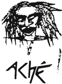
by Storme Webber