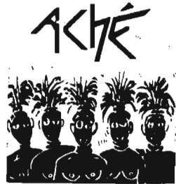
"5 Women Watching" by Barbara Sandidge

Order yours now. T-shirts are white, 100% cotton in sizes S, M, L, XL ($12) & 3XL ($15). Sweatshirts are available in gray, red, white and gold in sizes M, L & XL. ($20). Special hooded and larger-sized sweatshirts are available in gray, red and white in sizes 2XL, 3XL & 4XL. ($25). Not all colors and sizes are still available so call first to double-check availability.