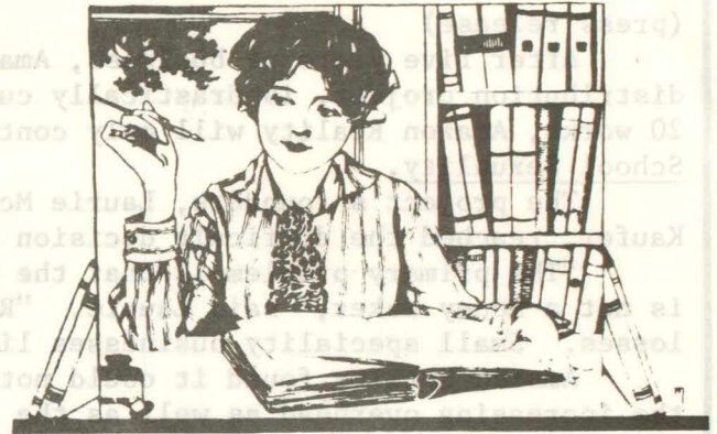
Bookplate from Helaine Victoria Press