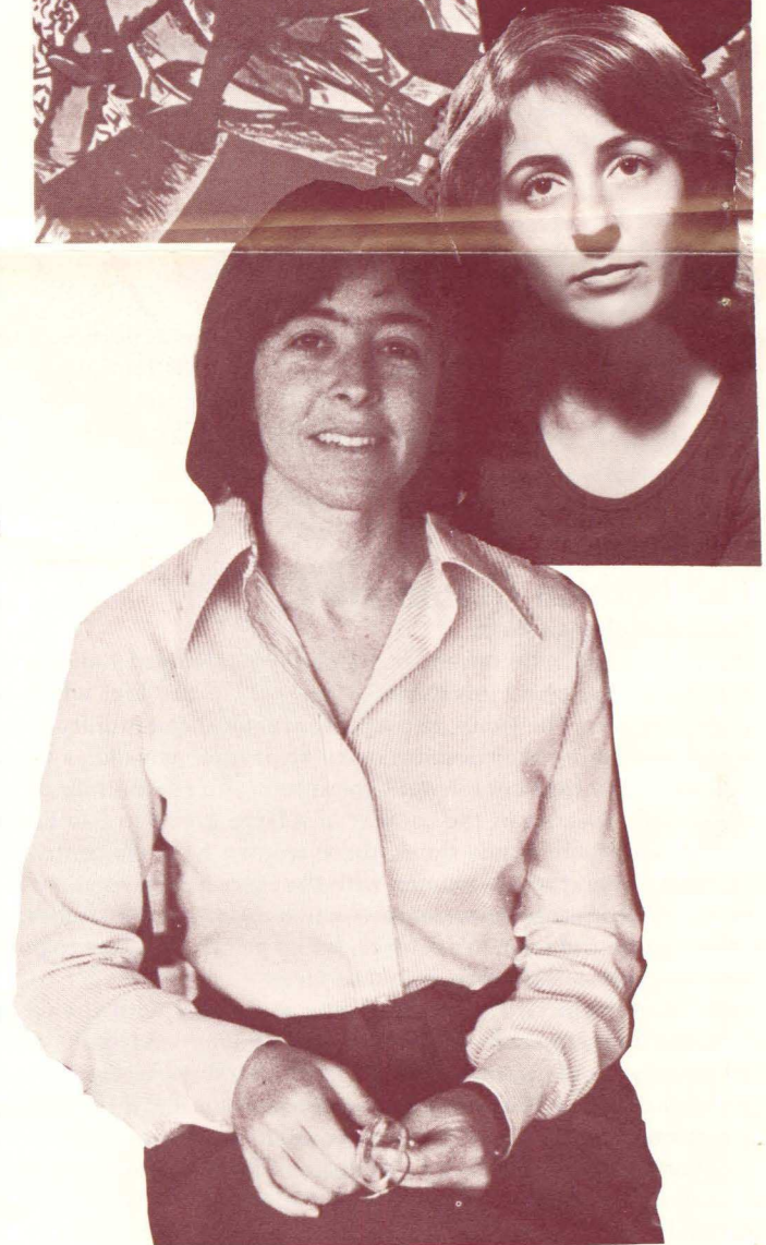
Cover illustration from Women in Soviet Russia Left: Nancy Chodorow Right: Gail Warshofsky Lapidus