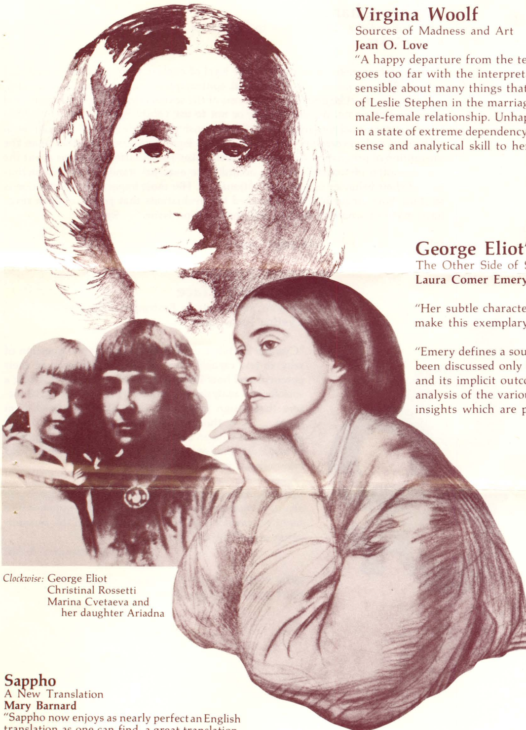
Clockwise: George Eliot Christina Rossetti Marina Cvetaeva and her daughter Ariadna

ISBN 03151-2 1976 672 pages 30 illustrations paper $8.95