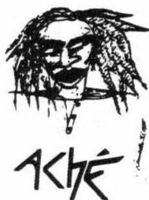
by Storme Webber