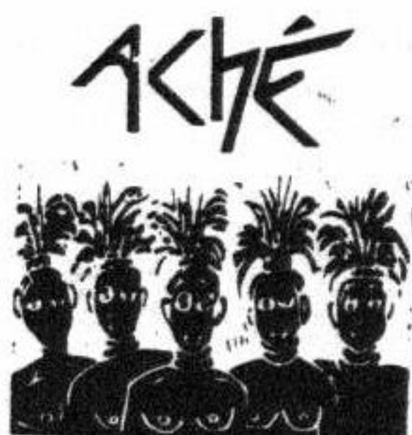
"5 Women Watching" by Barbara Sandidge

Order yours now. T-shirts are white, 100% cotton in sizes S, M, L, XL ($12) & 3XL ($15). Sweatshirts are available in gray, red, white and gold in sizes M, L & XL. ($20). Special hooded and larger-sized sweatshirts are available in gray, red and white in sizes 2XL, 3XL & 4XL. ($25). Not all colors and sizes are still available so call first to double-check availability.